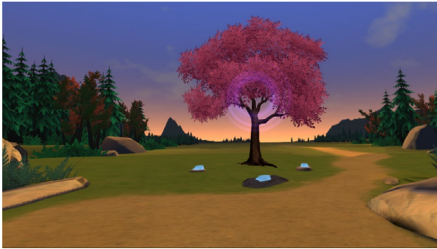
Figure 1. Two-dimensional still from the biofeedback environment. In this scene, purple rings move radially inward and outward to represent inhalation and exhalation, respectively. [Color figure can be viewed at wileyonlinelibrary.com ]

ilar nature environments. The BFD contained a virtual guide who instructed participants to breathe along with an oscillating pacer at six breaths per minute. Exhales were visualized by outward-moving blue particles, which increased in size as the participant’s respiratory rate more closely synchronized with the rate of the pacer. Guided audio prompts acknowledged effort while including reminders for slow and controlled breathing periodically. These audio prompts adjusted when participants had increased or decreased respiratory rates. Figure 1 shows an example of the environment.