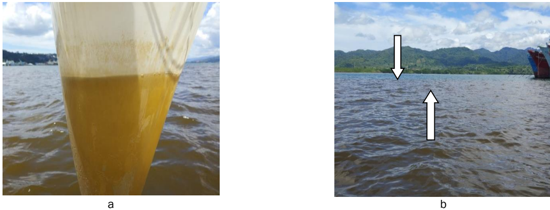
Figure 2. Deep-red brown colored (a) that makes the different color as a result of blooming of G. polygramma and Chaetoceros sp in the Inner Ambon Bay (b).

Blooms of G. polygramma (Figure 3a.) and Chaetoceros affinis (Figure 3b.), C. danicus (Figure 3c.) and C. decipiens (Figure 3d.) presented as a dense patch in the Inner Ambon Bay for about three weeks during the dry season of 2019. The high cell density caused the red brown colour of the sea surface. G. polygramma was mainly observed as a single cell (Figure 4a.) and Chaetoceros sp. was mainly in chains usually consisting of more than three cells (Figure 4b-d.).