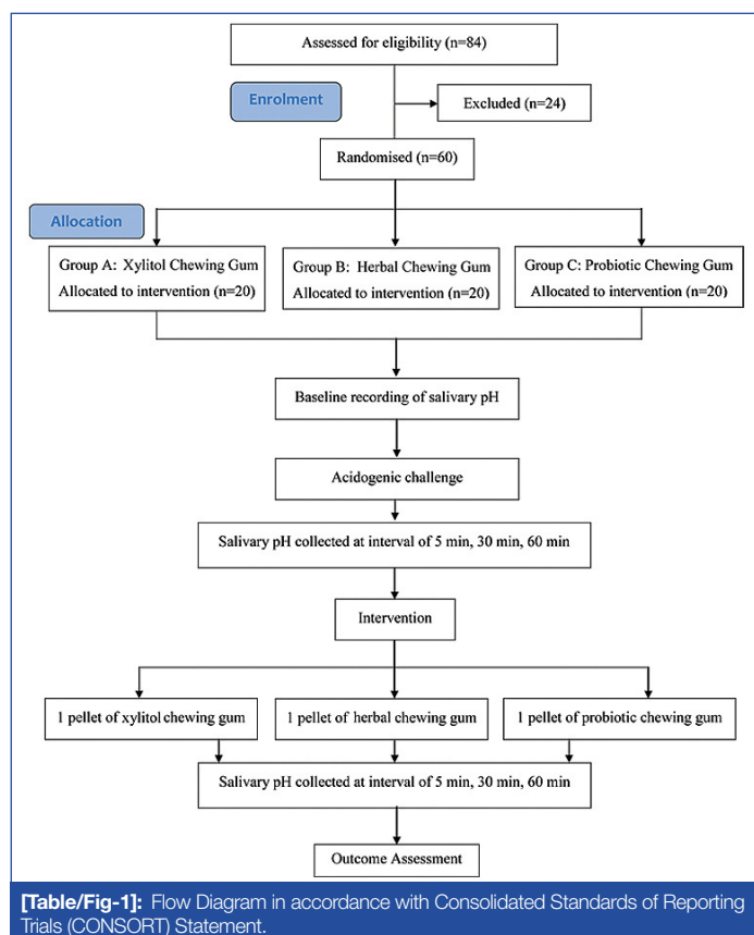
[Table/Fig-1]: Flow Diagram in accordance with Consolidated Standards of Reporting Trials (CONSORT) Statement.

Enrolled participants in all three arms and study coordinators were blinded to study group. All three chewing gums were provided as identically labelled white packing precoded by the study coordinators intermixed in the box [Table/Fig-1].